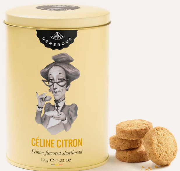
CÉLINE CITRON - 120g

Chocolate cookies with hazelnuts & fleur de sel. Shelf life: 10 months.