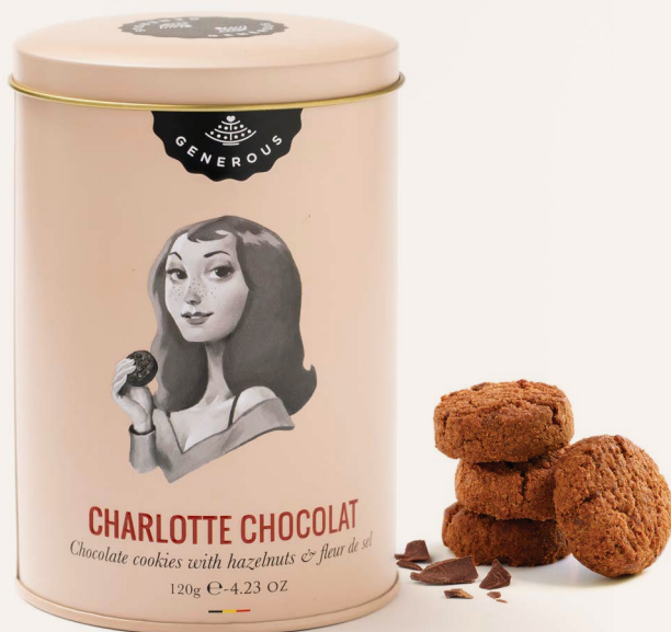
CHARLOTTE CHOCOLAT - 120g

Traditional speculoos coated in fairtrade dark chocolate. Shelf life: 12 months.