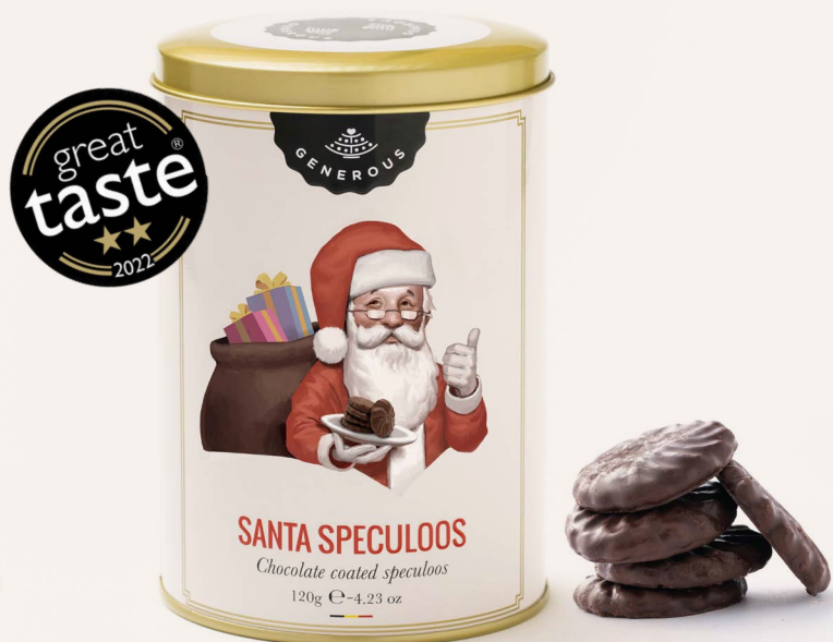
SANTA SPÉCULOOS - 120g

Saint-Nicholas speculoos. Shelf life: 12 months