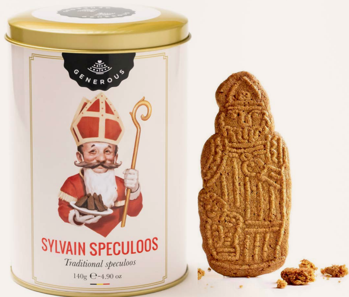
SYLVAIN SPÉCULOOS - 140g

Metal tins. Dimensions: 13,5 x diam 9,5cm Smells like tin spirit